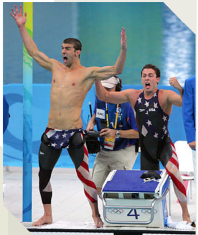
Reaction: 4x100m free relay

Good Luck, HRA! Looking forward to a great 2008-09 season!